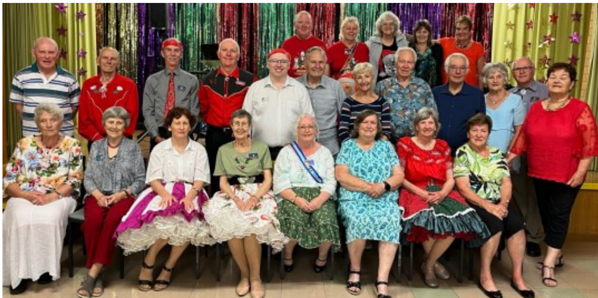
Sunset Twirlers Christmas Break Up 10 December 2024